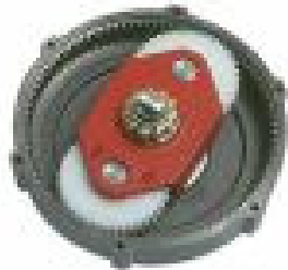
Transmission; double planetary